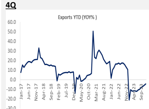
Figure 2: Exports turnaround towards