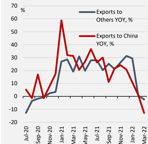
Figure 2: Exports Trend in Recent Months