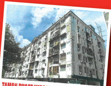
TAMAN PUSAT KEPONG, KUALA LUMPUR 855 sq ft - RM190,000