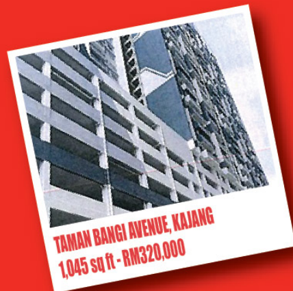
TAMAN BANGI AVENUE, KAJANG 1,045 sq ft - RM320,000