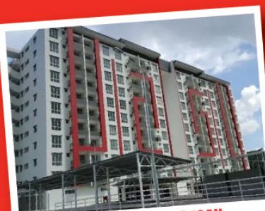
GREEN SURIA, SERI KEMBANGAN 1,212 sq ft - RM340,000