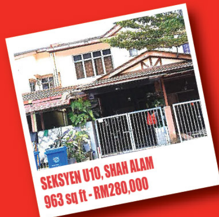
SEKSYEN U10, SHAH ALAM 963 sq ft - RM280,000