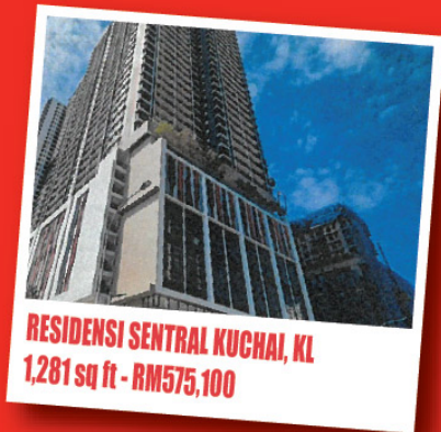
RESIDENSI SENTRAL KUCHAI, KL 1,281 sq ft - RM575,100