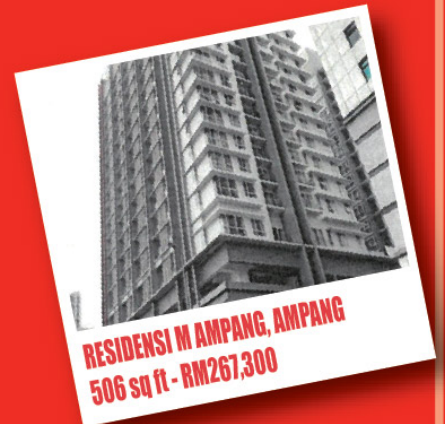
RESIDENSI M AMPANG, AMPANG 506 sq ft - RM267,300

PROSPECTIVE BIDDERS MAY SUBMIT THEIR BIDS FOR THE PROPERTY ONLINE