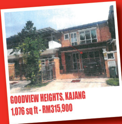
GOODVIEW HEIGHTS, KAJANG 1,076 sq ft - RM315,900